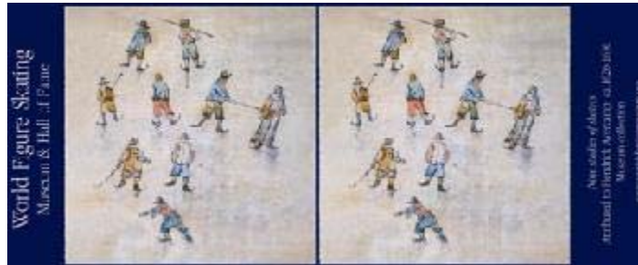
A prototype of the mug featuring the sketch "Nine Studies of Skaters" attributed to Hendrick Avercamp.

The third in a series of Museum mugs, this year's design takes a look at skating's past in Amsterdam, Netherlands.