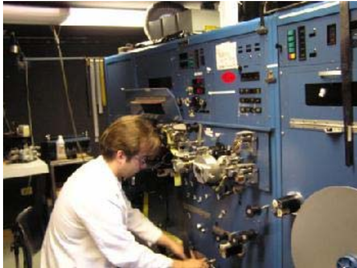
This specially designed machine incorporates the "wet-gate" process that handles older, shrunken film.

unique motion picture laboratory simply known as the CinemaLab . One of only four specialized laboratories in the country primarily devoted to historic film restoration, the CinemaLab will play an integral role in the World